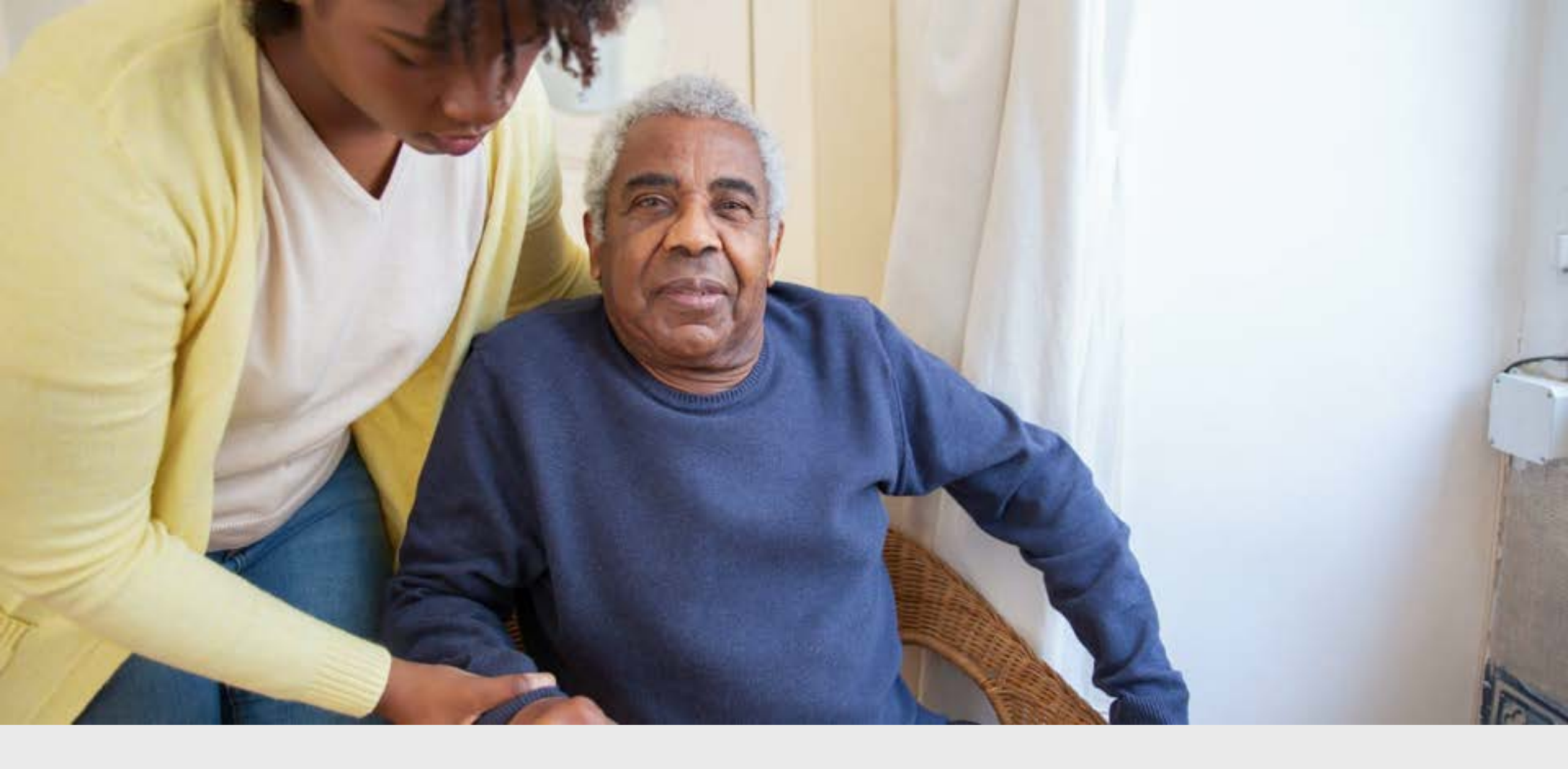
Virtual Human Services Career Fair